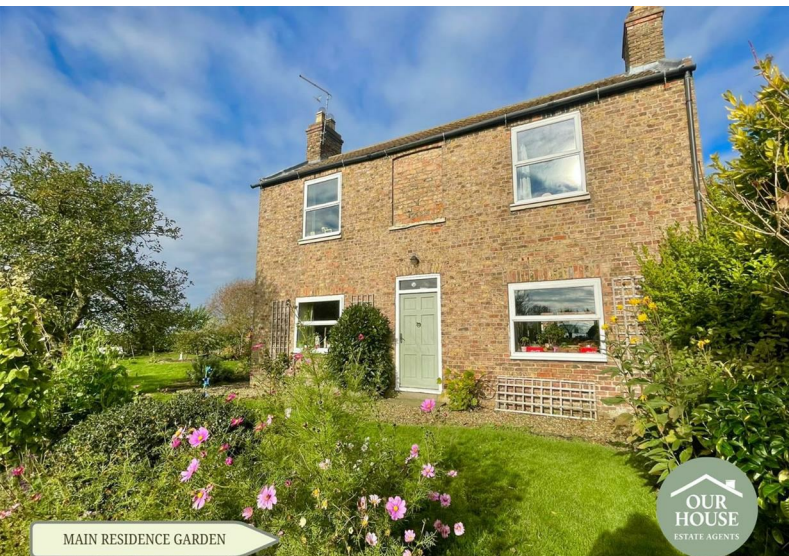
→ MAIN RESIDENCE GARDEN